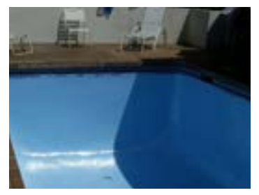
PROJECT: Neglected residential pool with plaster walls that were disintegrating. Customer received quotes of $20,000 plus to repair and resurface.

SOLUTION: Customer chose the PoolPoxi Top Coat Epoxy Coating System to resurface pool once the holes and cracks had been repaired. The total material cost was approximately $2000 to resurface the entire pool.