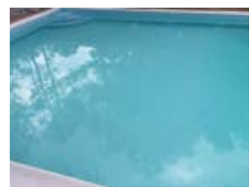
PROJECT: 40 year old residential pool in very bad repair and not holding water. Customer got several different quotes from pool contractors that were approximately $25,000 for repairs.

SOLUTION: Customer chose to use the PoolPoxi Top Coat Epoxy Coating system. Spent $5500 in coating material and hired an installer to complete project. Pool surface was completely restored and leaking stopped.