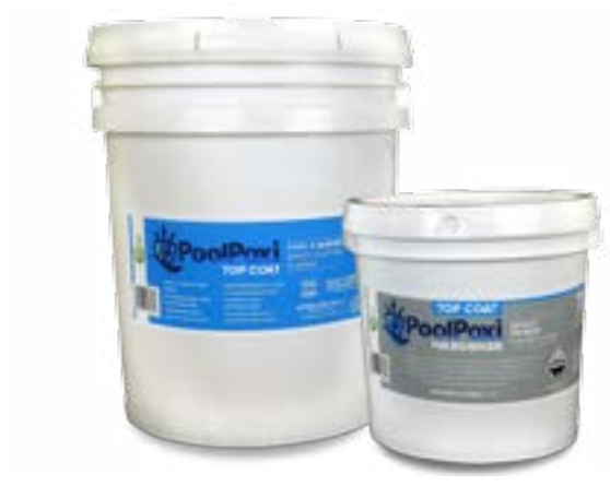
MIX RATIO 2:1